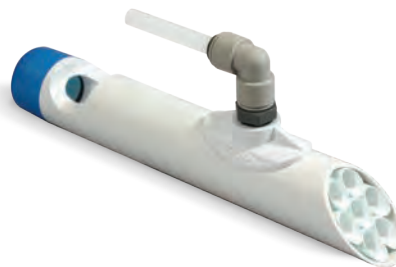
ULTRA-COR™ Half-inch Tubular Membranes