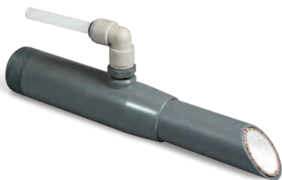
FEG PLUS 1-inch Tubular Membranes